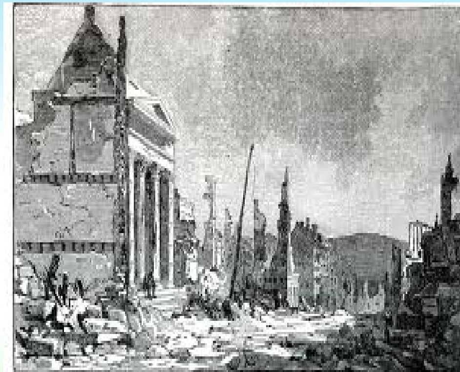
Richmond in ruins